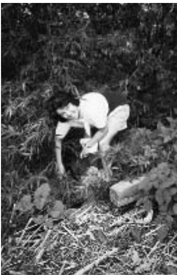
author exploring for fossils at Button Bay State Park